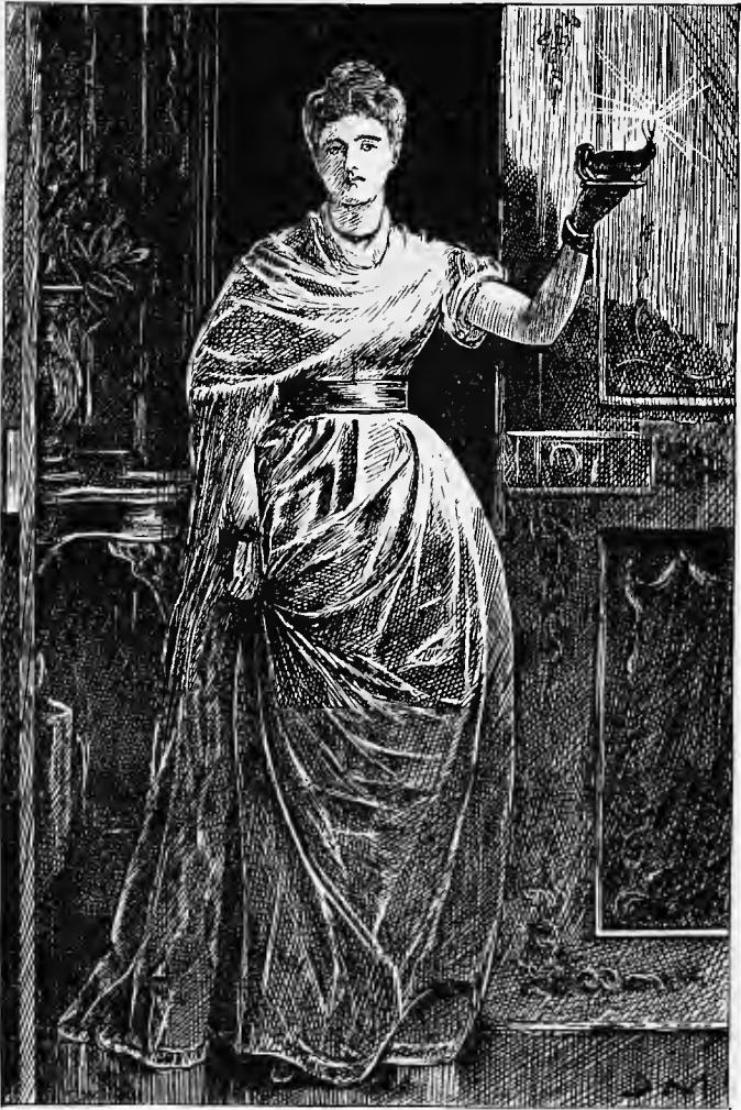
The lamps full glow illumined and shadowed her